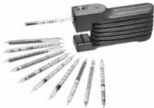
Figure 1: Dräger bellows sampler pump with tubes.