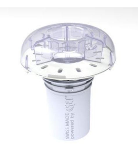
TIME TO CHANGE